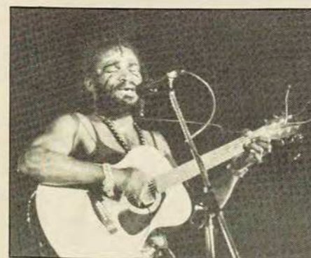
SPARTACUS R, performing on the main stage.

All day along the assembly area, the routes and in Hyde Park there will be peace floats, exhibitions, music, street theatre, giant puppets and banners.