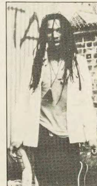
BENJAMIN ZEPHANIAH DUB RANTA (Radical poet) will be amongst the performers on the main stage, Hyde Park.